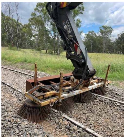
▲ Testing the track sweep process which involved three excavators. One fitted with plough and two fitted with brooms following along behind.